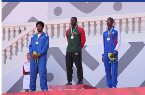
Team ISV gets the gold and more. pg. 2