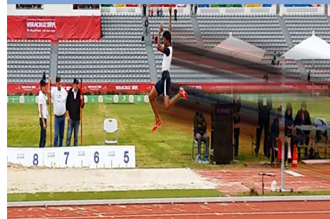
Chef de Mission Report CAC Games pg. 3