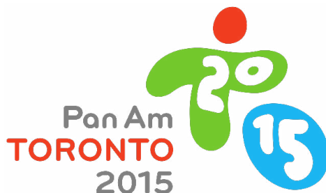
The Virgin Islands heads to Toronto. pg. 4